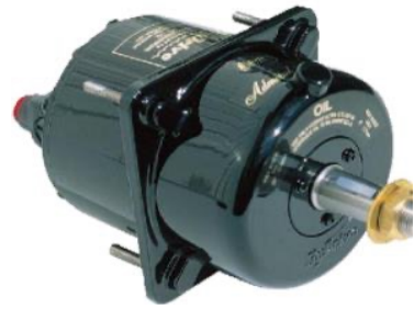
OPTIONAL Model 101 & 102 Mid-mount helm unit

Designed as a complete Do It Yourself installation, everything you need is supplied including detailed instructions. You don't even have to know anything about hydraulics!