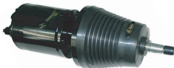
Fully tilting helm design Model 101 - Tilt or 102 - Tilt

Compact, front-mount standard helm with minimal protrusion from the console (with rear-mount kit fitted) Optional mid-mount or tilting helm style In-built lock-valve eliminates torque feedback. The wheel stays where you put it. Field replaceable shaft seal. Solid stainless steel helm shaft for optimum strength and durability. Superior material choice - even the wheel nut and washer are brass. 4 precision bearings for smoothest performance. All helms are built to High Performance standards - you don't pay more for HyDrive Power.