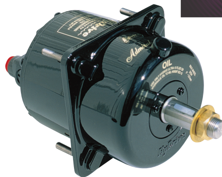
OPTIONAL Model 101 & 102 Mid-mount helm unit