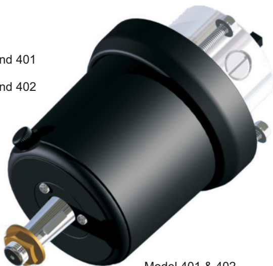
Model 401 & 402

Model 101 and 401 28cc/rev Model 102 and 402 35cc/rev